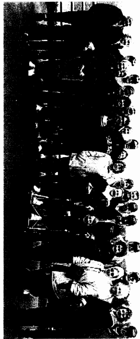
The Group at the Falls