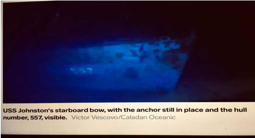
USS Johnston's starboard bow, with the anchor still in place and the hull number, 557, visible.